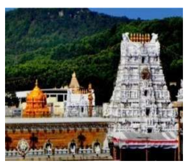
Sri Venkateswara Temple, Tirumala