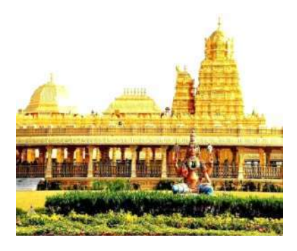
Golden Temple, Sripuram, Vellore