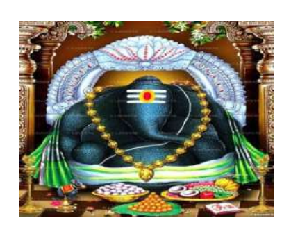
Sri Swayambhu Varasidhi Vinayaka Swamy Devastanam, Kanipakam