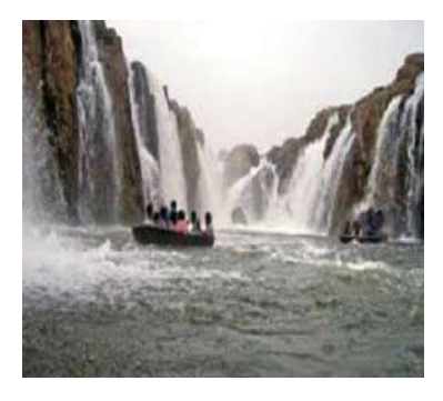
Hogenakkal Waterfalls, Tamilnadu