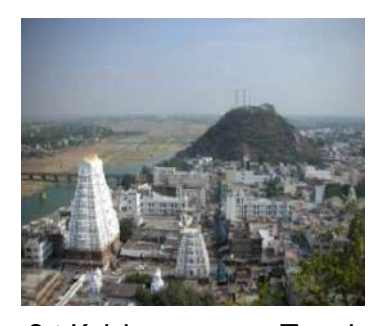
Sri Kalahasteeswara Temple, Srikalahasthi