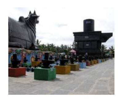
Kotilingeswara Temple, KGF